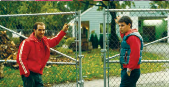
Cudmore's Garden Centre Opening Day 1986