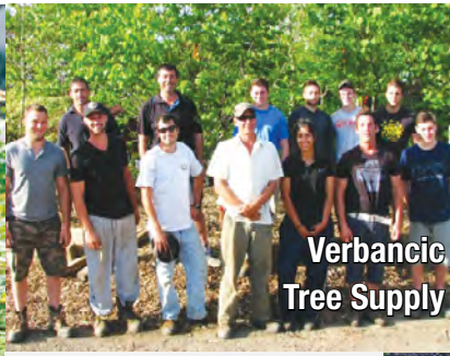
Verbancic Tree Supply